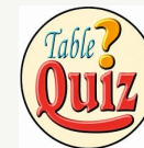
Table of 4, 10Euro per person. Great night assured. Support appreciated.

Ballygarvan GAA U13/14 will hold a ‘ Table Quiz ’ in Venue:- Bridgies Ballygarvan Date:- Saturday March 4th Time:- 8.00pm